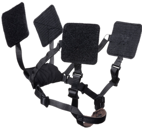
AIRELINK PLUS DIAL RETENTION SYSTEM