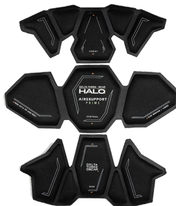
AIRESUPPORT PRIME SUSPENSION SYSTEM