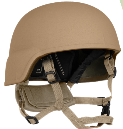
REGULAR-CUT / NO ACCESSORIES