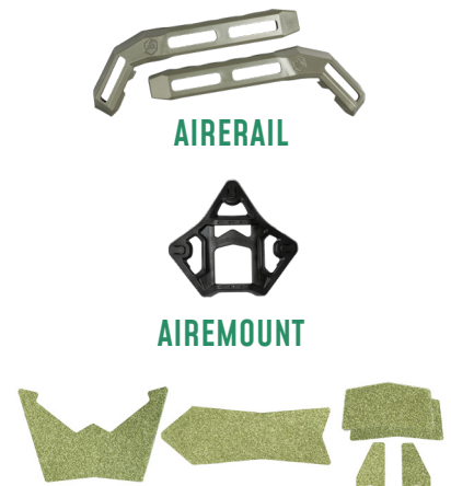
OPERATIONAL LOOP SYSTEM