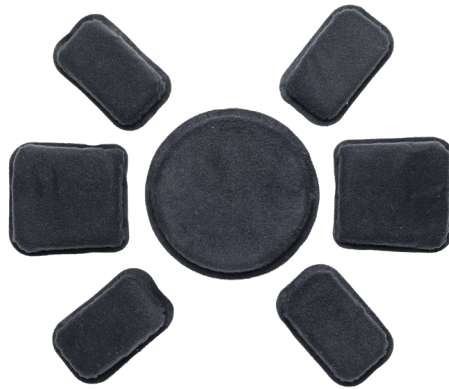
AIRESUPPORT SUSPENSION SYSTEM