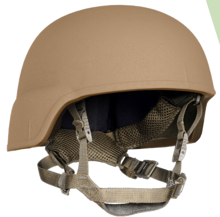
REGULAR-CUT / NO ACCESSORIES