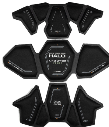
AIRESUPPORT PRIME SUSPENSION SYSTEM