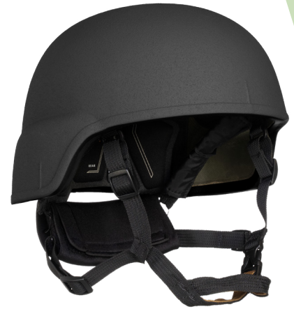
REGULAR-CUT / NO ACCESSORIES